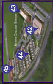
43 NEW COLLEGE HALL