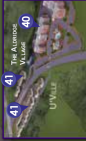
40 THE ALDRIDGE VILLAGE