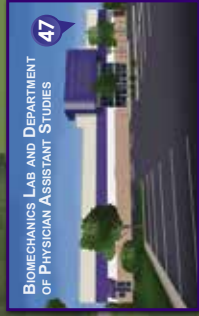
47 BIOMECHANICS LAB AND DEPARTMENT OF PHYSICIAN ASSISTANT STUDIES